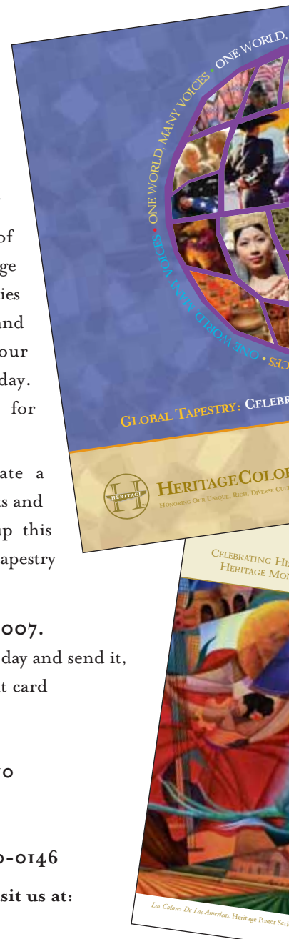
The Global Tapestry Calendar features original artwork from the Heritage Poster Series.

Thank you for honoring cultural diversity.